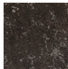
Slope 15518 LRV 7